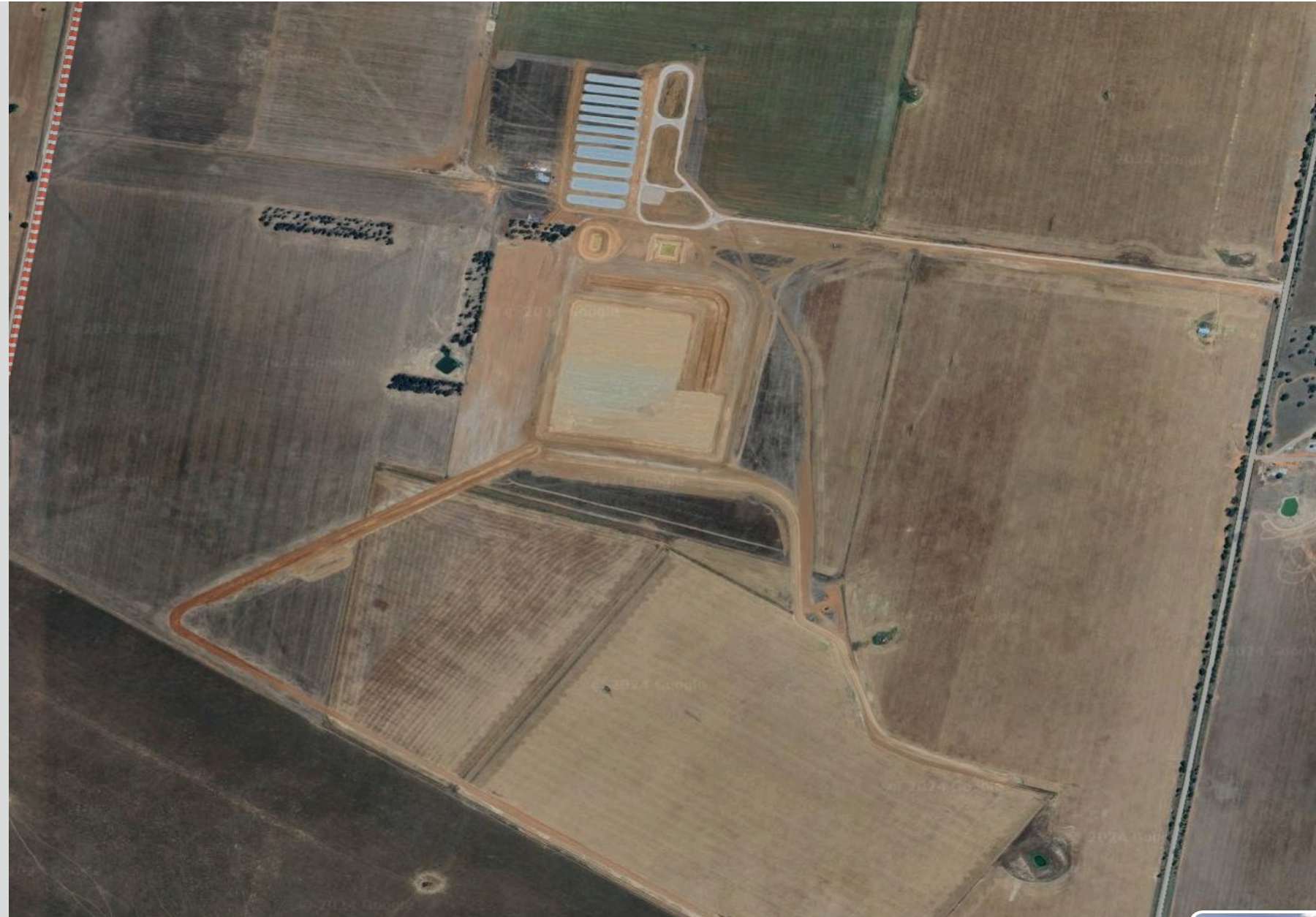
Guideline: Pollution Incident Response Management Plans B10