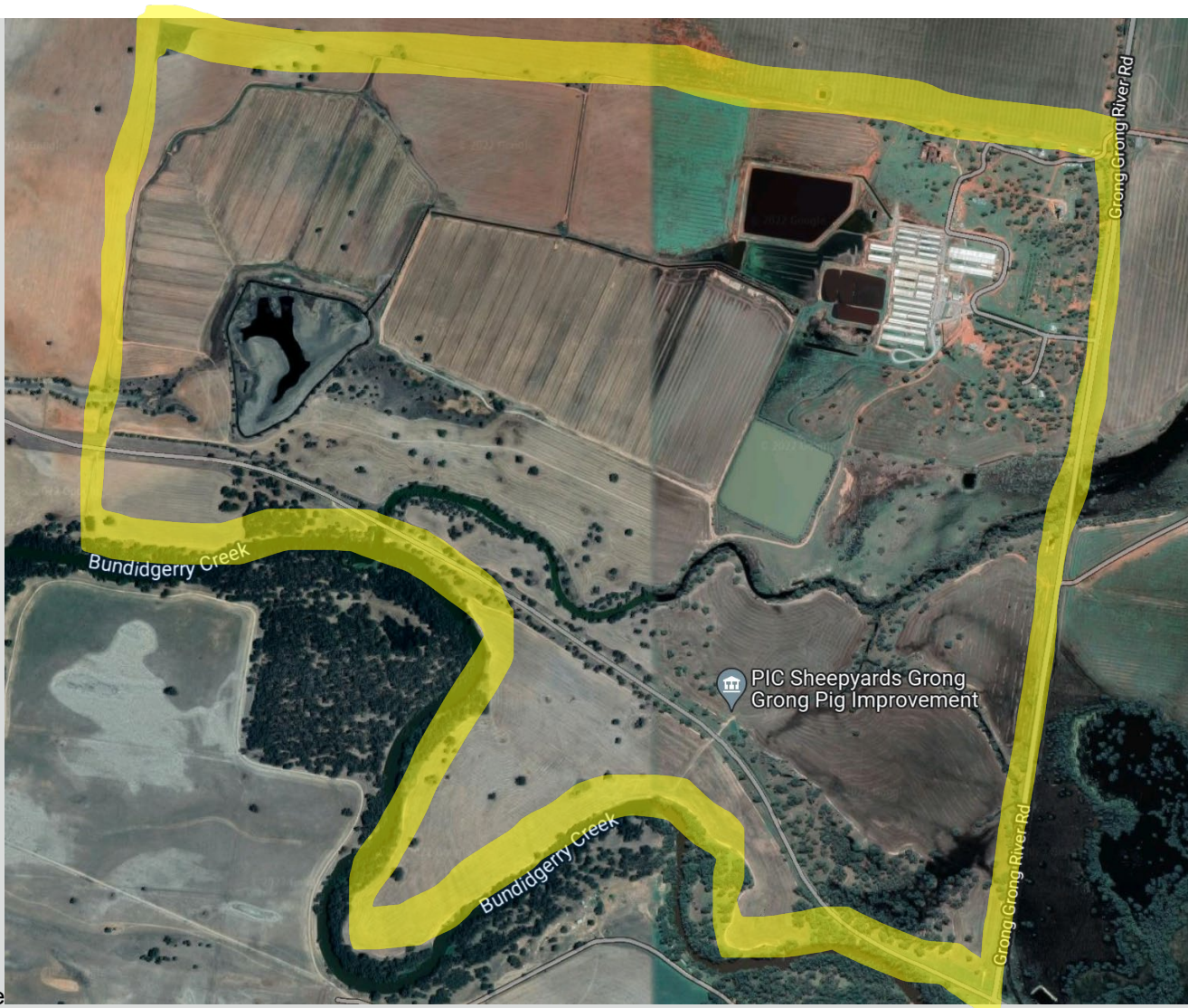
PIC Australia site